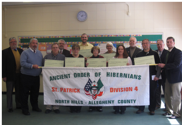
Angel Funds checks were presented to 7 elementary schools at the North Hills Catholic Elementary School Regional Office.

Few things are as precious to parents as a solid educational foundation based on firm religious principles for their children. But many families struggle to make this happen. The Ancient Order of Hibernians, Division 4, North Hills is dedicated to help these families through our Tuition Assistance Fund.